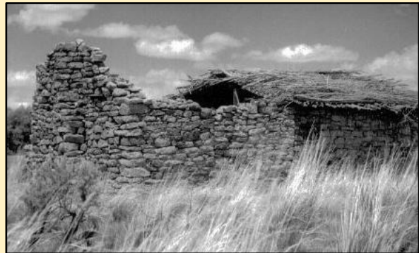
Figure 4. Nell Murbarger photographed this Camp McGarry ruin near Summit Lake in 1954.

Another troubling source of inaccurate information about Camp McGarry is the text of state-sponsored Nevada historical marker 162, situated on a county road in Soldier Meadow. Location error, inconsistency of nomenclature and a misleading inference about the year of establishment and size of the Paiute Reservation at Summit Lake are especially disturbing (Basso, 2008).